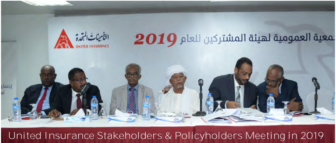
United Insurance Stakeholders & Policyholders Meeting in 2019