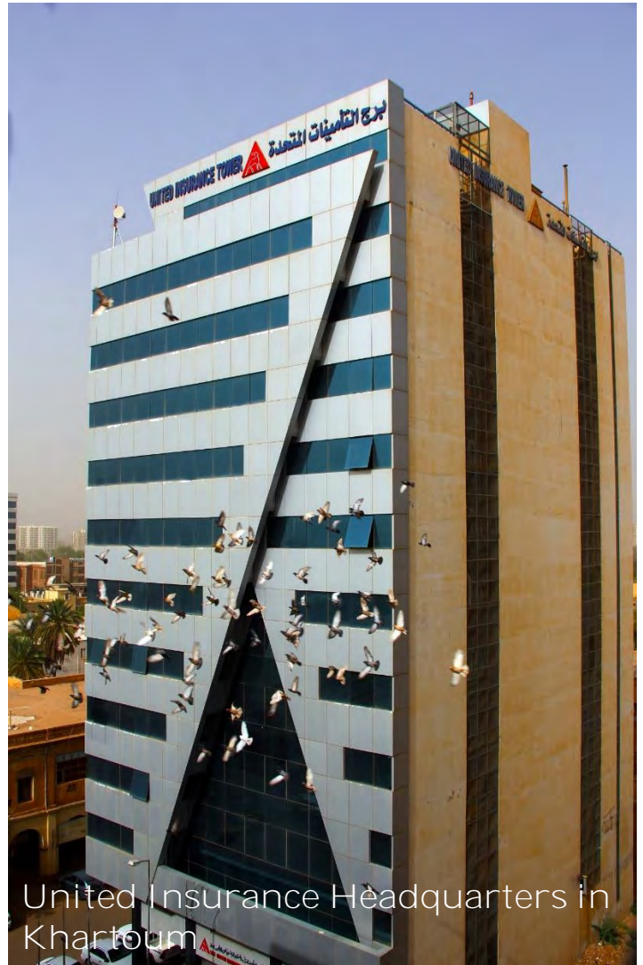
United Insurance Headquarters in Khartoum

We believe in our unique adoption of Takaful insurance in giving the best value for insurance customers by allowing them seats on the Board of Directors and most importantly by giving them the sole right of distribution of all company surplus (Net profit). We were the first company in the market to apply this system most transparently and fairly possible and believe this is the 'Disruptor' Factor that will make us compete in the international insurance arena.